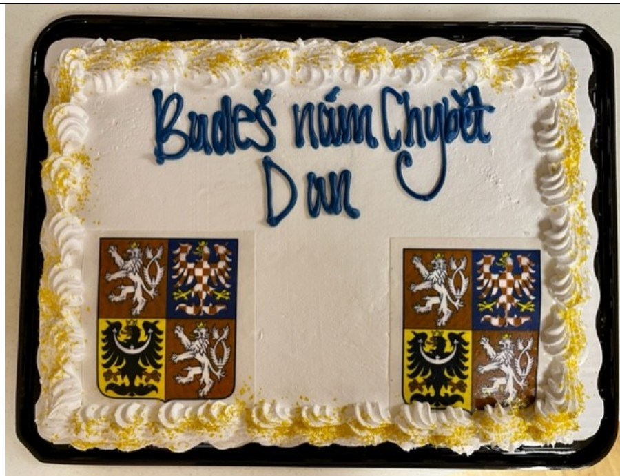
The going-away cake for Dan U.